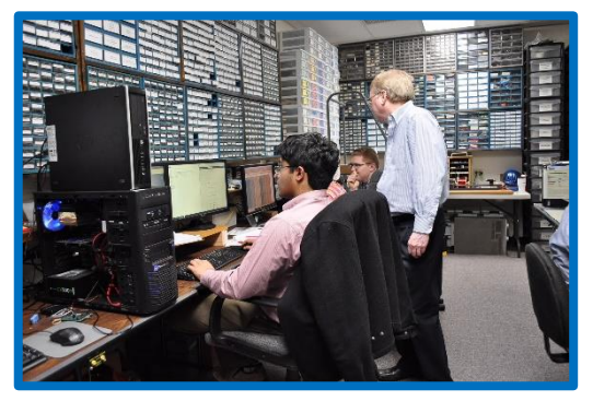
Kalman filter analysis with a physicist...wow...

Interested? The most productive interns haven't always been the straight "A" students or those who excel in school. We're more interested in chemistry and collaboration than we are in grades, and we place a higher value on integrity and commitment than we do pedigree.