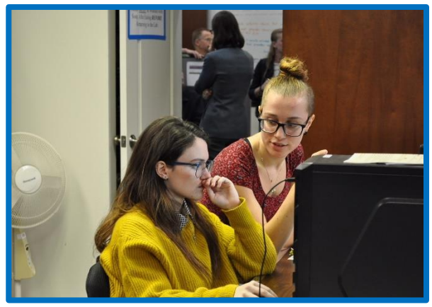
Formulating inertial measurement algorithms in order to analyze complex motion in 3 axes.

The Culture: Although our Company's professional staff provide constant instruction, oversight, and assistance, the interns occupy two large connected "bullpens" (Engineering and Marketing) in the center of the building, for which the Intern Managers are responsible. This gives the students an opportunity to not just create their own environment, it also allows them to sharpen their "soft skills" as they collaborate to achieve specific objectives. Our young men and women - from different backgrounds and schools and having widely diverse skill sets and personalities – experience the working world firsthand and they come to appreciate the real meaning of responsibility and accountability. The interns also develop the strong bonds of friendship and camaraderie, which is very rewarding to our staff, both personally and professionally.