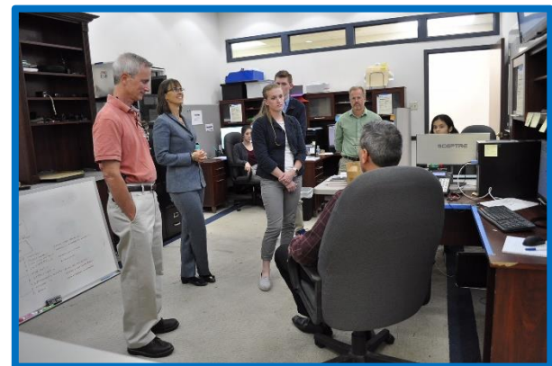
Marketing interns and our professional staff collaborating on a client presentation that included a new website and promotional product videos.