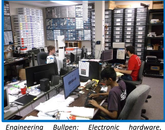
Engineering Bullpen: Electronic hardware, firmware, and Java Dashboards in development.

n <sup>th</sup> Solutions, LLC , founded in 2006, is a product development, business incubation, and manufacturing company headquartered in Exton, Pennsylvania whose design team holds more than 50 commercialized patents. The Company has an established vertically-integrated business model that "Advances Innovation from Concept to Revenue": our expertise is developing intellectual property into marketable technologies and products that provide practical solutions to many different kinds of problems.