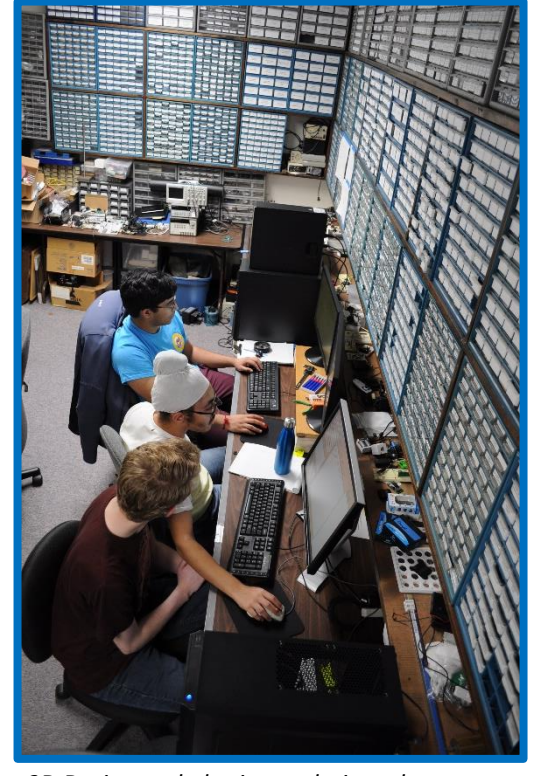
3D Design and physics analysis underway as the interns prepare for a product launch.

n^{th} Solutions offers a unique and widely acclaimed paid internship program for high school students, typically involving 15 students from 5 or more local high schools. The two and three-year programs offer several tracks: Engineering and Marketing.