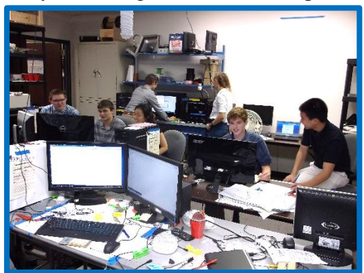
Hardware, software, firmware, 3D design, & experimentation result in 5-Star products.

The Future Value: High school seniors who have been in the program for at least one year receive a Letter of Recommendation written by one or more of the Company's professional staff. It is an honor to recognize their accomplishments in writing which frequently include being coinventors on pending and/or issued patents, developing commercialized products, creating client and company websites and videos, and dozens of other noteworthy accomplishments. The Letters often result in scholarships, grants, and full rides at various colleges and universities, and it is not unusual for interns to actually receive offers of professional employment upon graduation from high school.